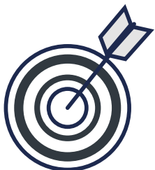
Priorities and Goal(s)